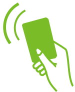
Access Control System

Our Pro series tripod turnstiles represent classic and safe way to protect your premises. They are widely used in various indoor environment applications. They fit perfectly as an economical option into the office buildings and other related applications.